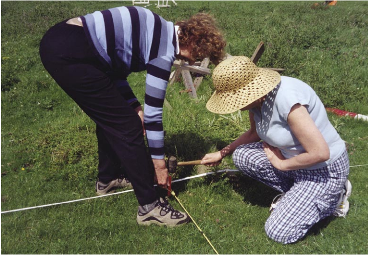
GeoPhysics in the Pingle field - technical stuff