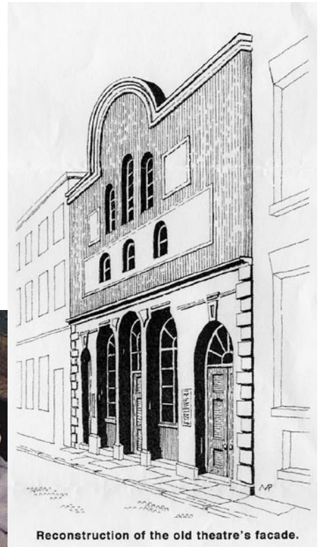
Reconstruction of the old theatre's facade.

In June, a visit to the National Coal mining Museum is planned. This should be an exciting and absorbing visit with a chance to ride in the cage to the depths of the mine, some 140 metres.