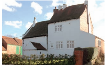
Castle Nursery House

*9 on the Trail Map is Castle Nursery House, a white plaster clad house with pantiled roof and outbuildings. This has a grade II listing with parts of it dating to the early 17th century. The structural timber at the end of the building, (best viewed from the gate), indicates the dwelling is of timber frame construction and probably the oldest in the village.