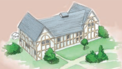
An impression of Lambley Manor House

A rental document of 1459 describes the manor house at Lambley as having two storeys with seven rooms, standing on a mound surrounded by a moat, with a complex of buildings including a granary, brewhouse, bakehouse, malt kiln and stables. It had been demolished by 1609, when a map was drawn up which shows the moat, but with no buildings in it.