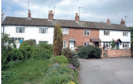
Stocking Frame Workers' Cottages

Beyond The Lambley restaurant and pub to the left stands a terraced row of Stocking Frame workers cottages (23-29 Main St.) dating back to the 1700s when framework knitting had become an important industry in Lambley (*2) .