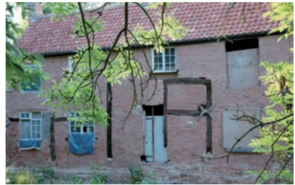
Brookside Cottage being restored

The building on the right, Brookside Cottage ( *1 on the Trail Map ), has undergone restoration. It is the one of the oldest buildings in Lambley, from the 17th century. Grade II listed, this timber frame building has an interesting example of 'brick noggin' infill between its timber studs.