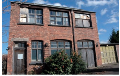
I & R Morley's Factory

*8 illustrates the location of I & R Morley's Stocking Factory, a tall two storey brick building on a private lane behind New Row. It was established in 1890 for the manufacture of men's stockings using Griswell machines powered by an engine run on paraffin. The building consisted of two large full-length rooms with stairs at one end. Both floors housed machines and the holes for the drive belts can be seen on the upper floor. The windows were purposefully large but candles and oil lamps had to be used to provide sufficient light. The factory employed women exclusively, who, despite a fireplace on each level, found it a cold draughty place in which to work.