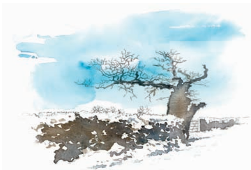
Illustration of Blasted Oak

Follow path downhill. On reaching gate go straight on over footbridge